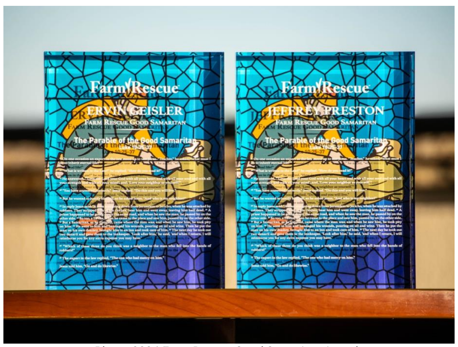
Photo: 2024 Farm Rescue Good Samaritan Awards *CLICK TO DOWNLOAD HIGHER RESOLUTION IMAGE