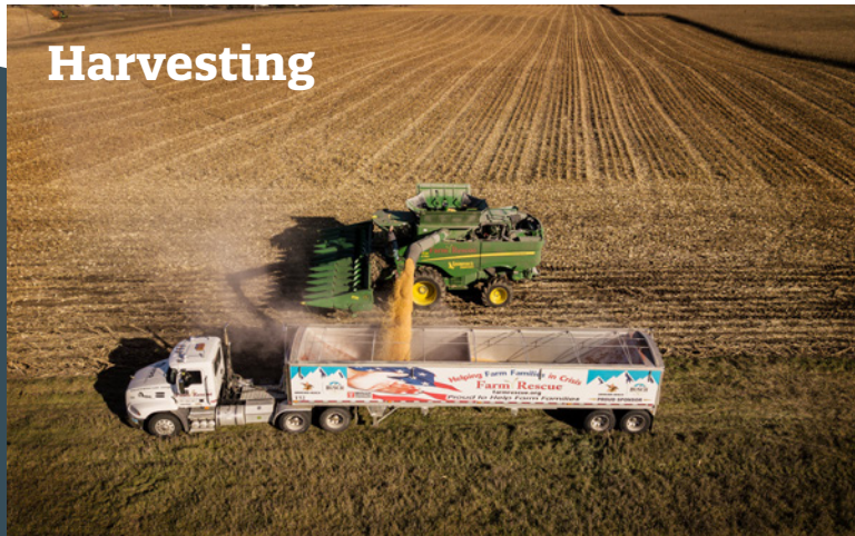
John Deere: 3 Combines, 2 Draper 40' Platforms, 1 Draper 45' Platform, One 12-row Cornhead • Wilson: 4 41' Grain Hoppers Unverferth: 1 Header Trailer