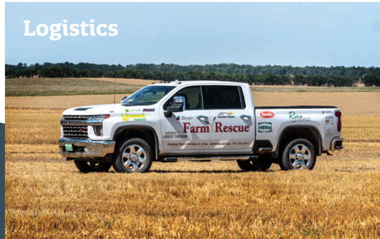
John Deere: Two 6-Series, One 8-Series, Two 9-Series Tractors Mack: 5 Semi Tractors • Freightliner: 1 Semi Tractor Landoll: Low-boy Trailer • Chevy: 10 Pickups • Ford: 1 SUV