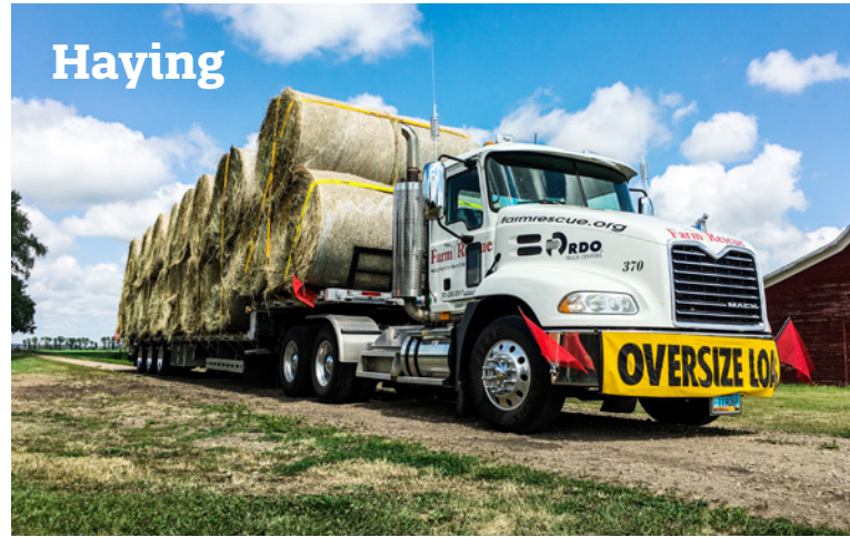
John Deere: 2 Round Balers • Haukaas: Bale Cart