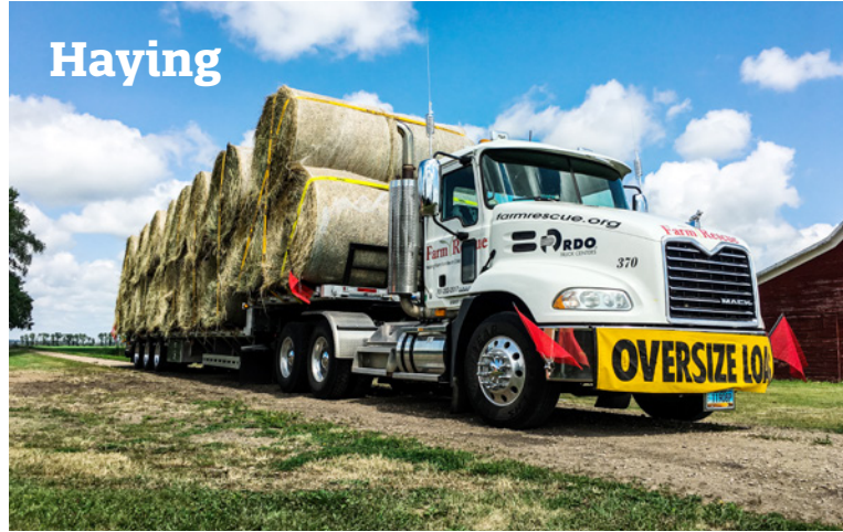
John Deere: 2 Round Balers, 2 6-series Tractors Mack: 2 Semis with Flatbed Trailers