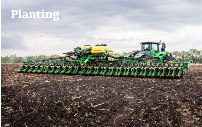
John Deere: 2 60' Air Seeders, 1 Corn/Bean 24/48 Row Planter, 2 9-series 4-wheel Tractors, 1 8-series Row Crop Tractor