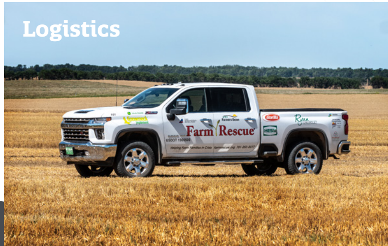
Chevy: 10 Pickups Landoll: 1 Semi + Low-boy Trailer