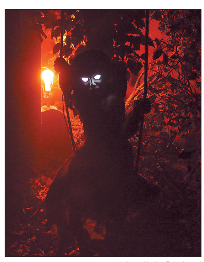
One of the 20 rooms features a young child swinging and singing a sweet — or creepy — lullaby.

Online condolences at www.glendenilson.com