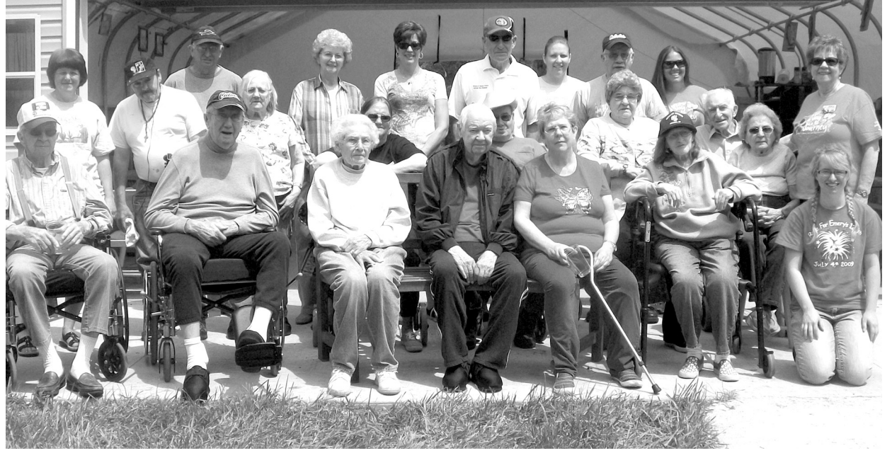
A GREAT DAY OF FISHING WAS HAD BY ALL! This Fishing Pond Inc. just west of Bridgewater. A great time group of the Diamond Care Center residents, staff, and was had by all and the fish were biting! volunteers recently participated in a fishing trip to My

reacquainted with someone you may have not seen in some years.