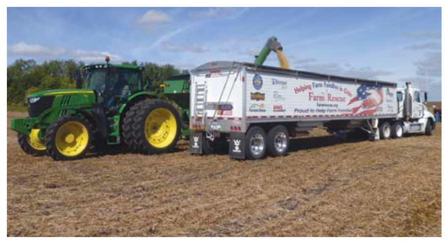
Farm Rescue harvests a crop for a Minnesota farmer whose wife had terminal cancer.

was 20 families that received help, and now, in Farm Rescue's seventh year, up to 50 farm families will have benefited by the time harvest is complete.