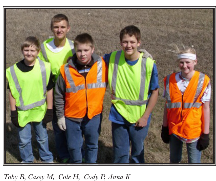
Tipping fees imposed by land-$250,000 every year fills cost Mn/DOT approximately