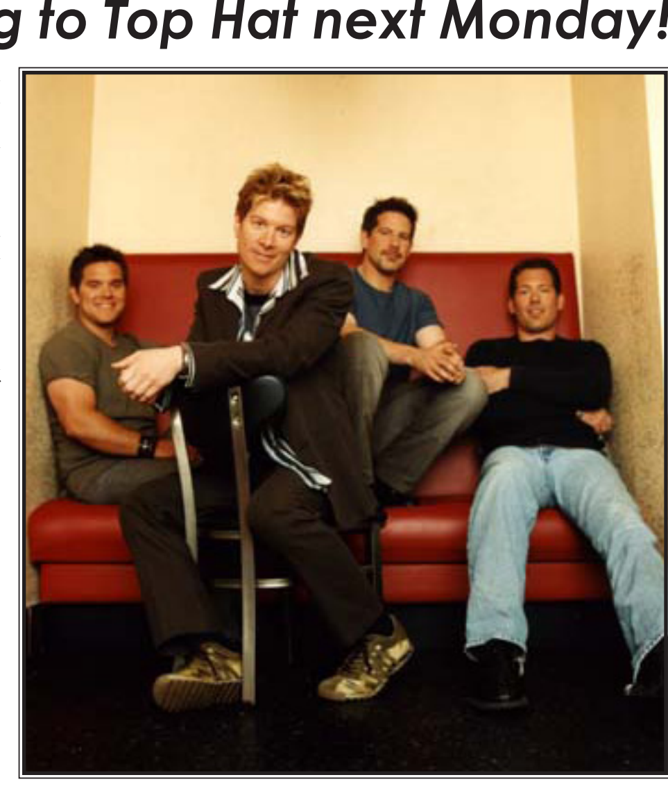
See you at Tonic Sol-fa on Monday, May 7, 7:30 p.m.