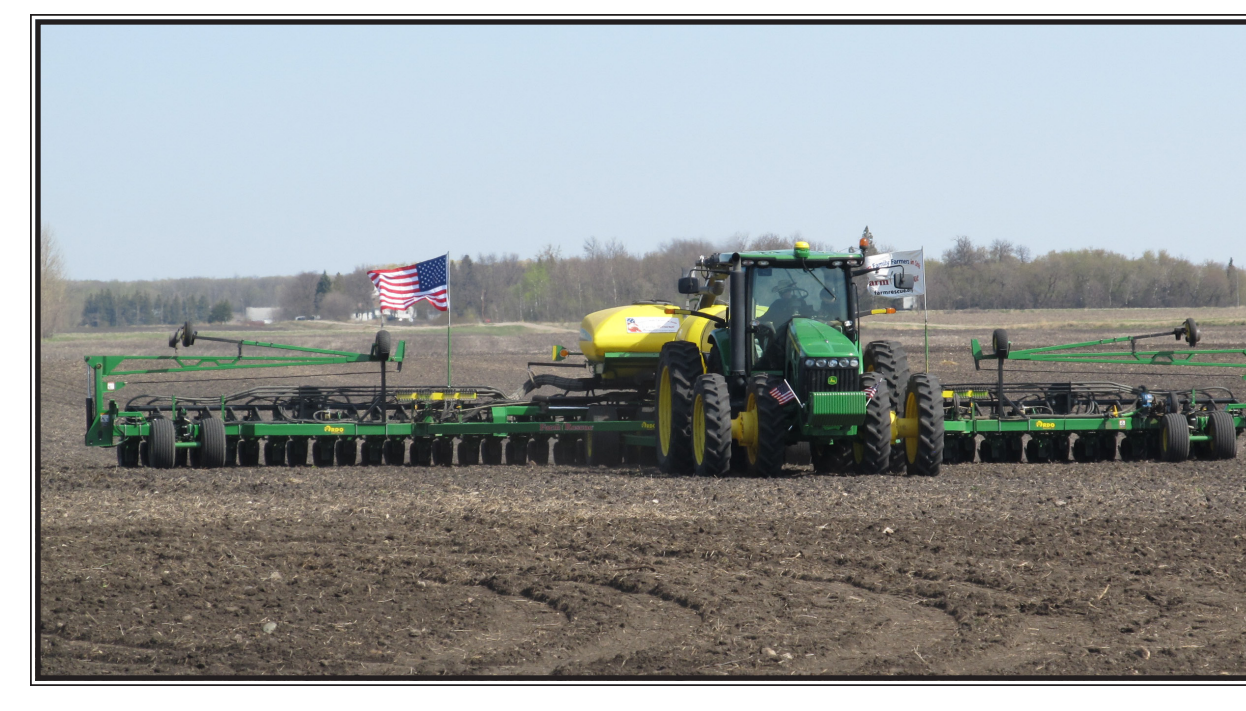
Levi, a Farm Rescue volunteer from Sioux City, IA gets the planter ready to go.